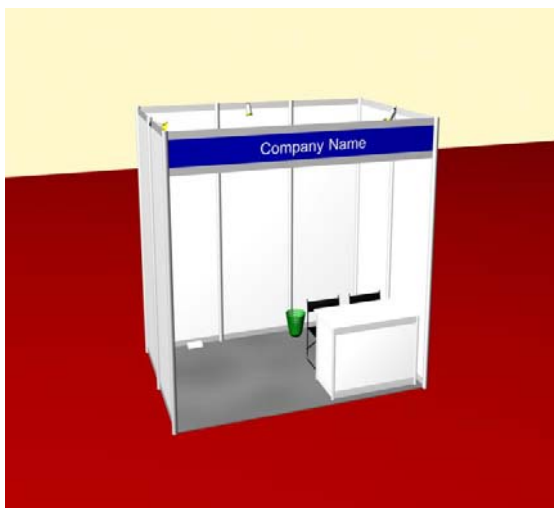
Stall Type I: 3 X 2m